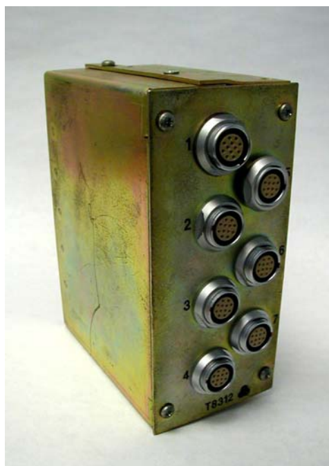
Figure 5-9 Expander Interface Adapter (Rear View)