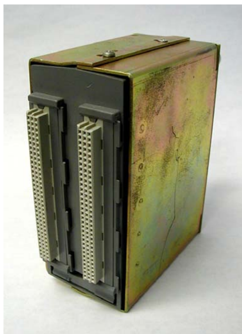
Figure 5-8 Expander Interface Adapter (Front View)